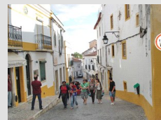
Participants at Evora Daffodil Summer School stroll through the UNESCO world heritage city

In 2011, the Summer Institute will take place in a "Western European" location as well as an "Eastern European" location, each lasting 2 weeks. In the Netherlands, the Summer Institute is patronized by the Regional Education Centre Landstede in the beautiful historic town of Zwolle, in North-East