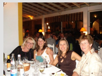
Swedish-Portuguese fraternity at Daffodil Summer Course in Evora