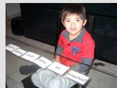
A reading lesson according to Sue Buckley's method