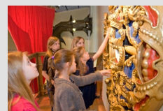
Alla ombord! – Det salutogena museet.