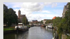
Feuerstein Institute July 2011 in Dutch historic town of Zwolle