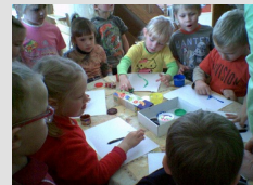
Children in Norway working in a Concept Teaching Model session

Since the origin in 1986, PIN has increased its number of projects in Czech Republic as well as in countries meeting disasters of several kinds. Among their highlighted projects in CR are those with regard to social exclusion. In 2010 the impact has been on work with Roma children in kindergarten and primary school ( http://www.clovekvtisni.cz/index2en.php?id=423 ). To prevent failure and exclusion, PIN in one of their VARIANTY projects establish clubs for preschool children, in which activities aim at learning in cognitive, cultural and social domains. http://www.varianty.cz/index.php?id=3&item=39 . This is their way to defeat an assessment practice equal to which is described in the "Daffodil Blackbook". In this project several methodologies are mediated to teachers and pre-school teachers; among them CTM (Concept teaching