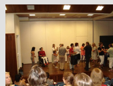
Changing to a musical modality: a theater play group of youngsters with and without disability inviting the Daffodil participants to a dance on the podium at Evora University