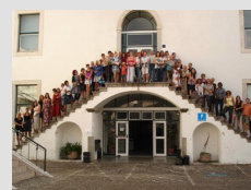
The 68 participants at the Daffodil Summer School at the University of Evora, september 2010