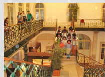
Music is a universal language: Portuguese traditional songs presented to the Daffodil Summer Course participants at the Town Hall of Evora

famous Dutch TV presenter Ria Bremer followed him during 18 years .